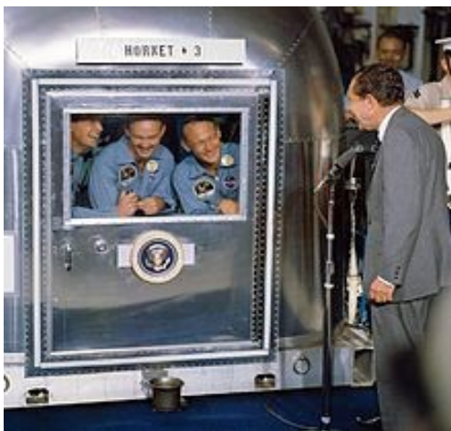
President Nixon and the Apollo Crew

A presidential party consisting of President Richard Nixon, National Security Advisor Henry Kissinger, and several other dignitaries had flown to Johnson Atoll on Air Force One. They spent one night on board the USS Arlington. They flew in Marine One to the USS Hornet for a few hours of ceremonies. He told them: "As a result of what you've done, the world has never been closer together before." After Nixon departed, the Columbia was lifted aboard the USS Hornet, placed on a dolly, and also placed into the ship's quarantine bay. A few days later the Columbia and its